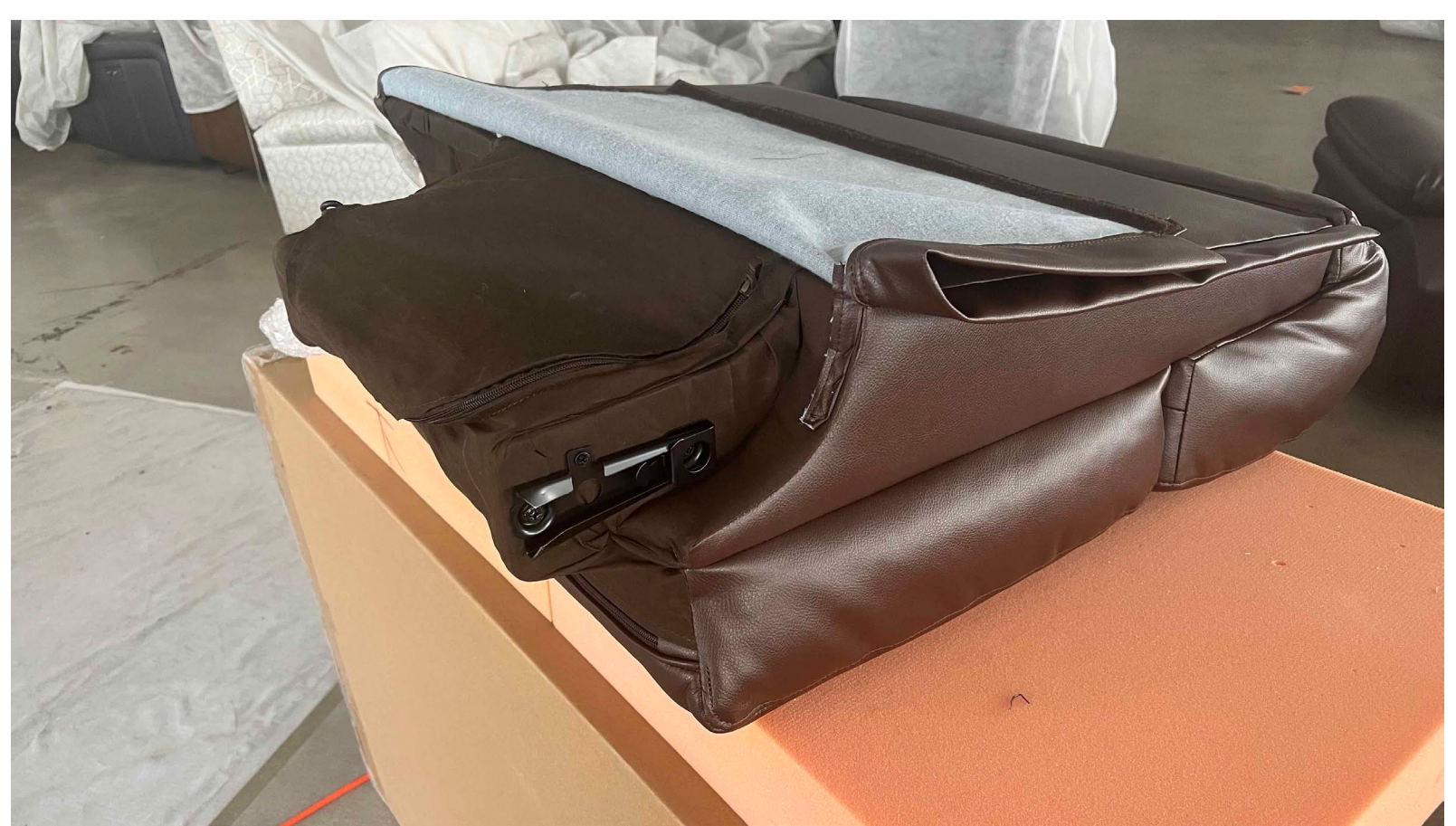
01. Lay down the back cushion, fold the back flap to reveal the zipper