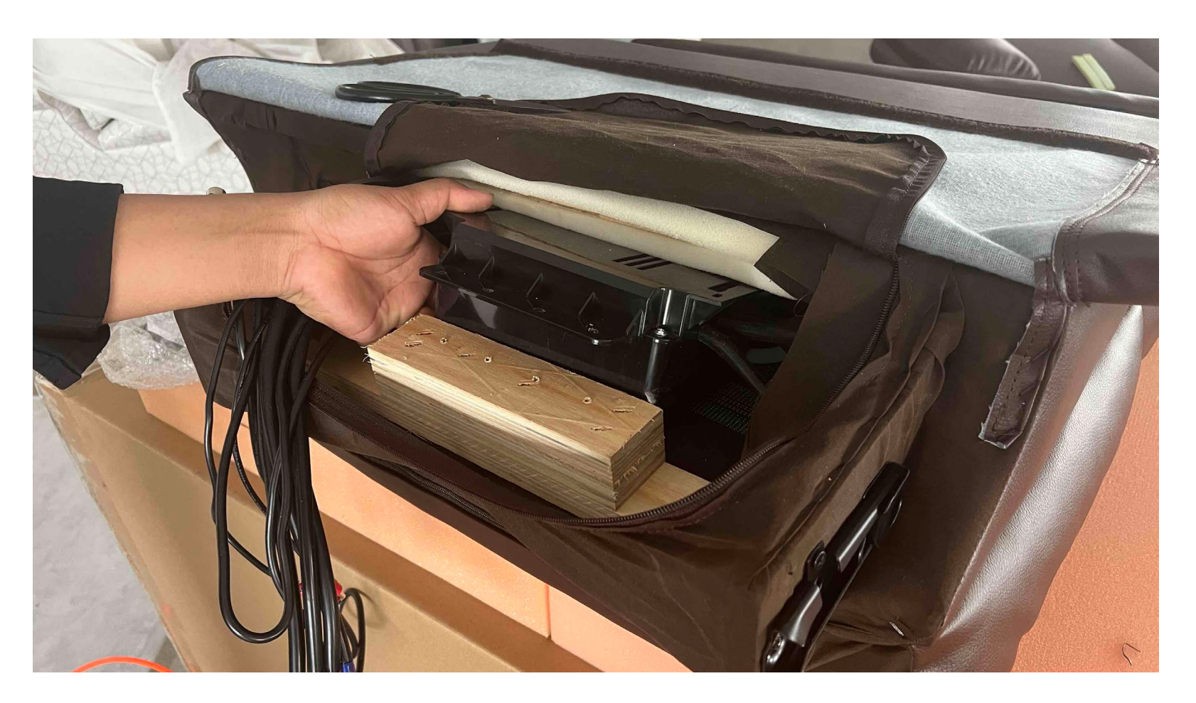
08. Pull out the control box