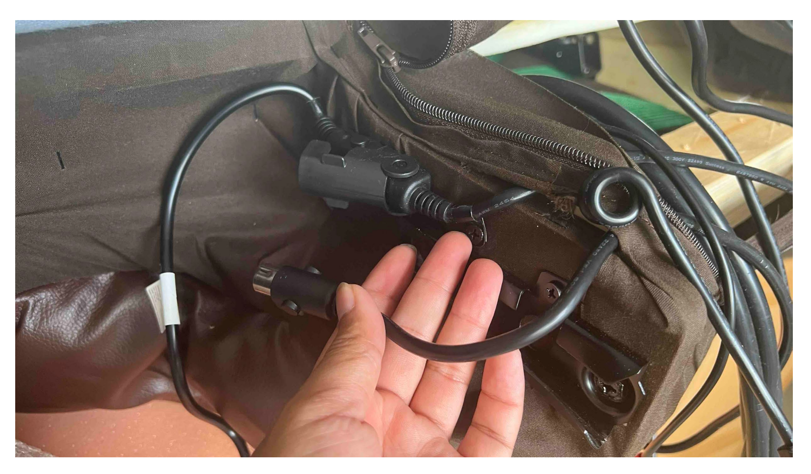
14. Hand wand connector & seat motor connector need to lean outward as shown in the image.