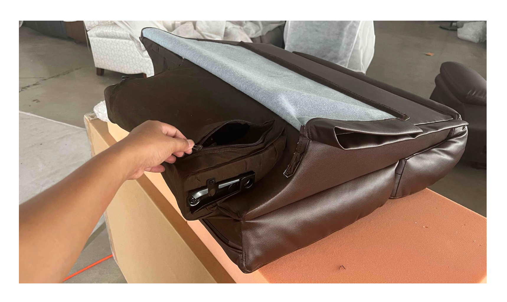
02. Unzip the rear bottom of the back