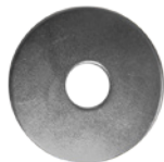
(20) 1 1/4" washers