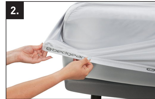
2. Starting at the foot of the bed, stretch the sheet over each corner of your mattress.