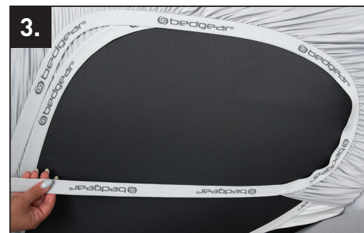
3. Raise the bed's base one side at a time. Lift the mattress head and grab the sheets Powerband strap. Slide the Powerband along the outer length of the mattress.