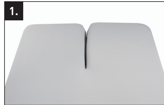
1. Lay your BEDGEAR Split Head Fitted Sheet flat on top of your mattress, aligning head and foot.

Be sure to wash your new sheet set before use for optimal performance.