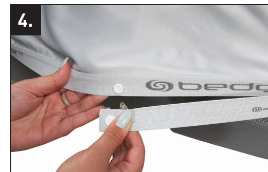
4. With the Powerband strap in-hand, locate the snap about halfway down the long side of the sheet on the Powerband and attach the strap to it.