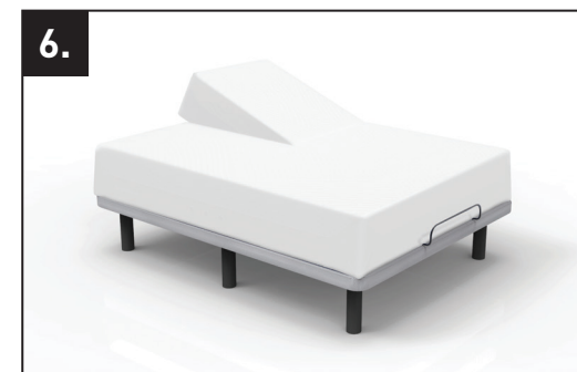
6. Congratulations! You have successfully installed your BEDGEAR Split Head Fitted Sheet!