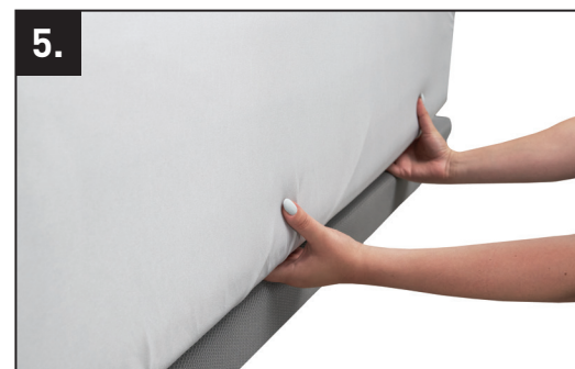
5. Articulate your mattress down and tuck the elastic under the mattress. Smooth out the surface to remove wrinkles.